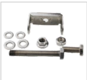
304# SS brackets