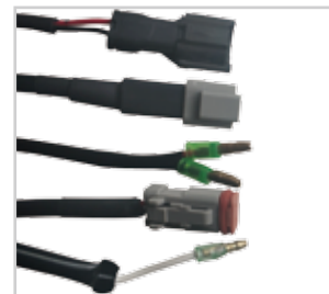
Dedicated plugs for different excavators