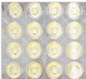
Quality PC lens